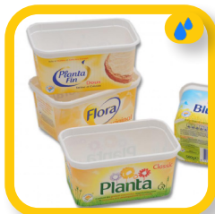
Ice Cream/Butter Containers