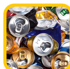
Aluminium Drink Cans