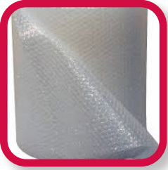
Bubble Wrap and Plastic Packaging