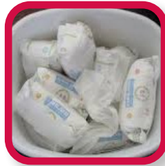
Dirty Disposable Nappies