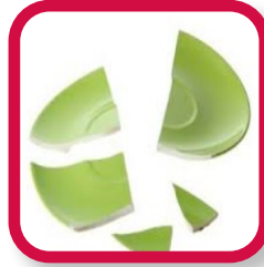
Broken Ceramics/ Crockery