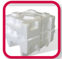
Styrofoam and Polystyrene balls