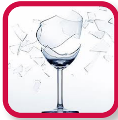
Wine and Drinking Glasses