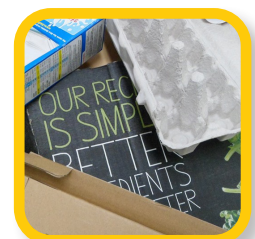
Cardboard, Pizza Boxes and Egg Cartons