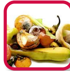
Household Food Scraps