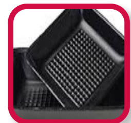
Meat and biscuit trays