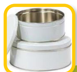
Chocolate and Biscuit Tins