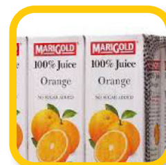
Foil Lined Cartons