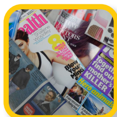
Newspapers and Magazines