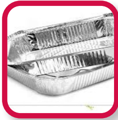
Tin foil including chip packets and chocolate wrappers