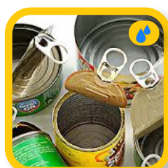
Aluminium Food Cans