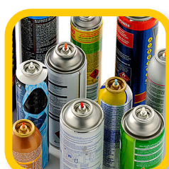
Empty Aerosol Cans