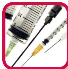
Needles and medical waste (sealed in a durable container)