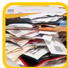
Junk Mail and Scrap Paper