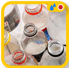
Drink and Milk Bottles