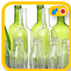
Juice and Soft Drink Bottles