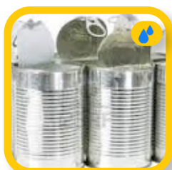
Steel Food Cans