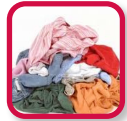
Clothing and Fabrics