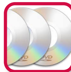
CD's, DVD's, VHS