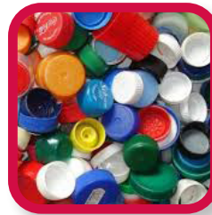
Wine and Drink Bottle Lids