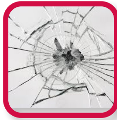
Broken Window/Plate Glass and Mirrors