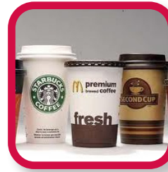
Disposable Coffee Cups