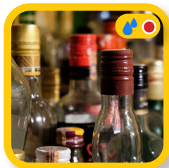
Oil, Sauce and Vinegar Bottles