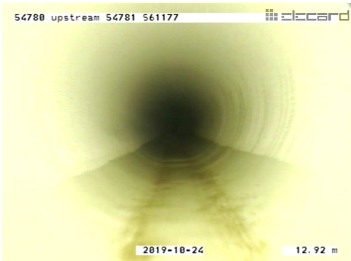
Fig. 2 Sewer Main above after the rehabilitation program