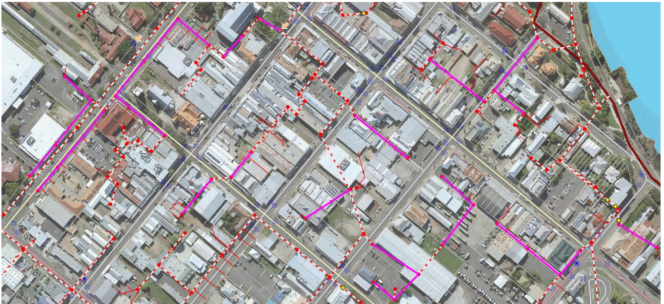
— Rehabilitated Sewer Mains