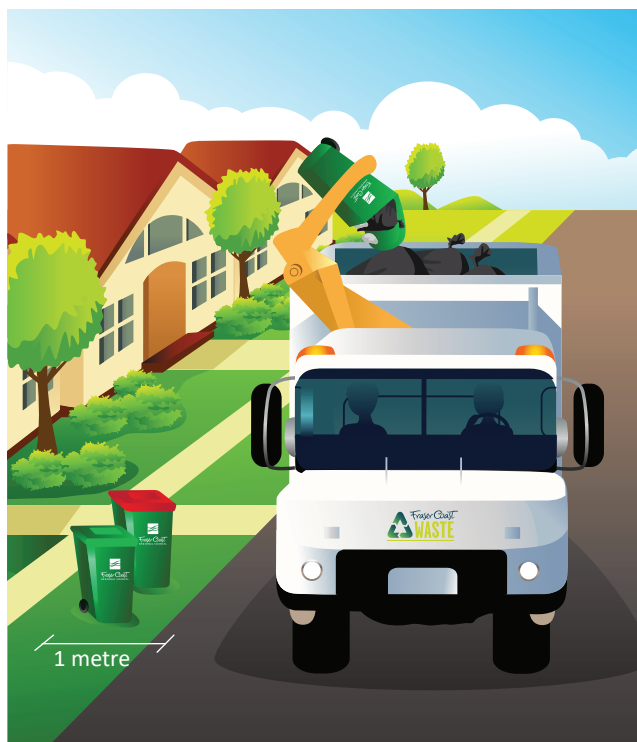
** Example of waste container position kerbside on collection day

As general waste bins are repaired or replaced, the lids will be transitioning from Green to Red to align with industry standards.