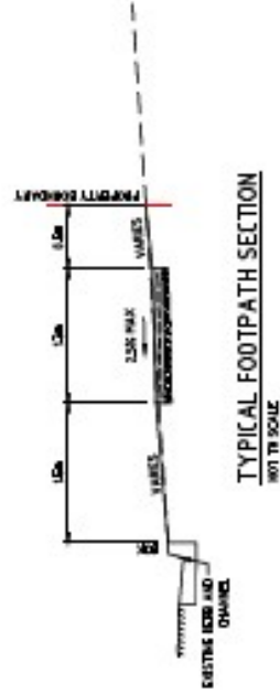
TYPICAL FOOTPATH SECTION NOT TO SCALE