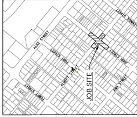
LOCALITY PLAN NTS