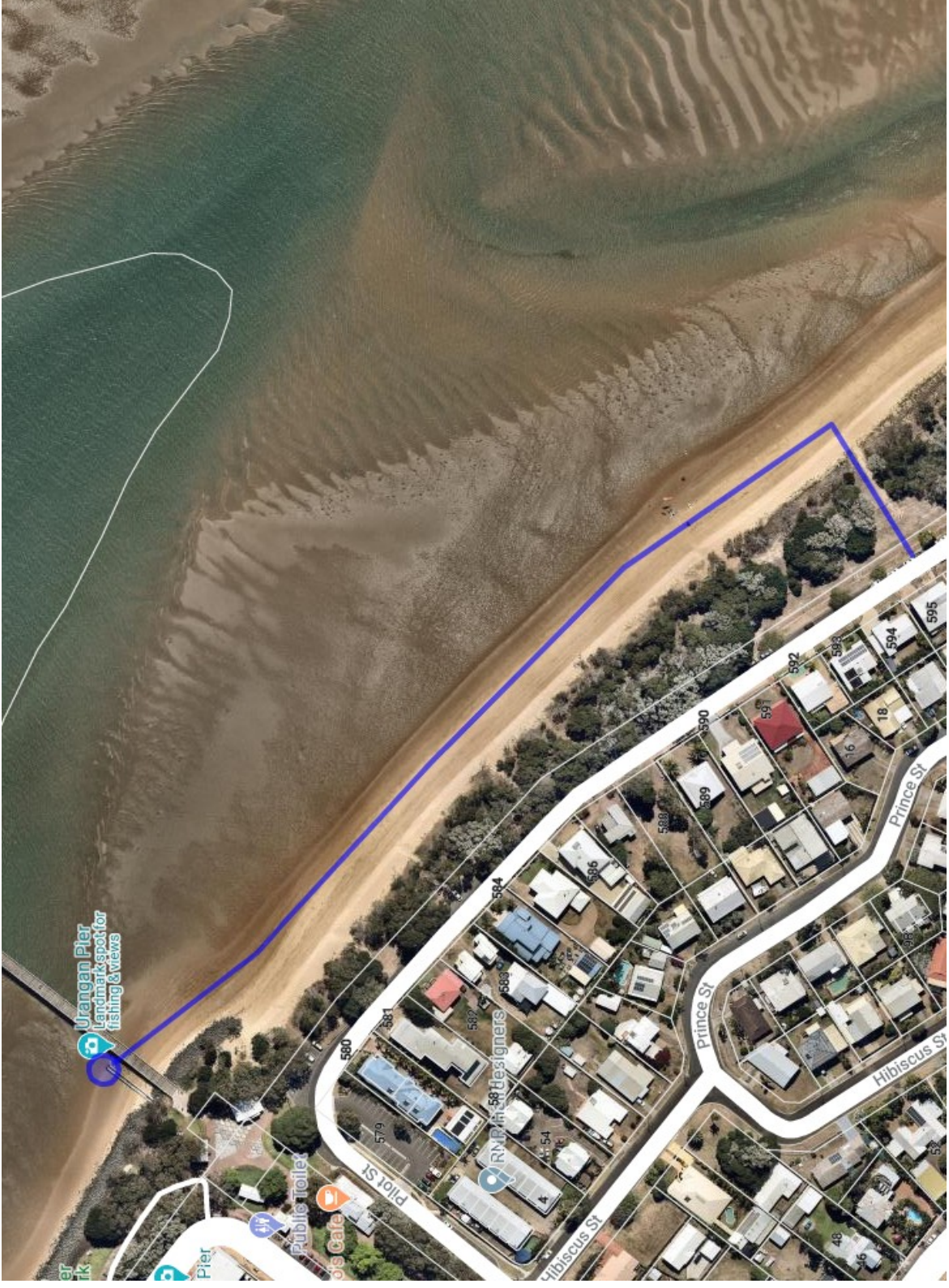
Replacement of Geotextile Sand Containers — Adjacent to Urangan Pier (Plan detailing Beach Access Point that will be used to access the construction site)