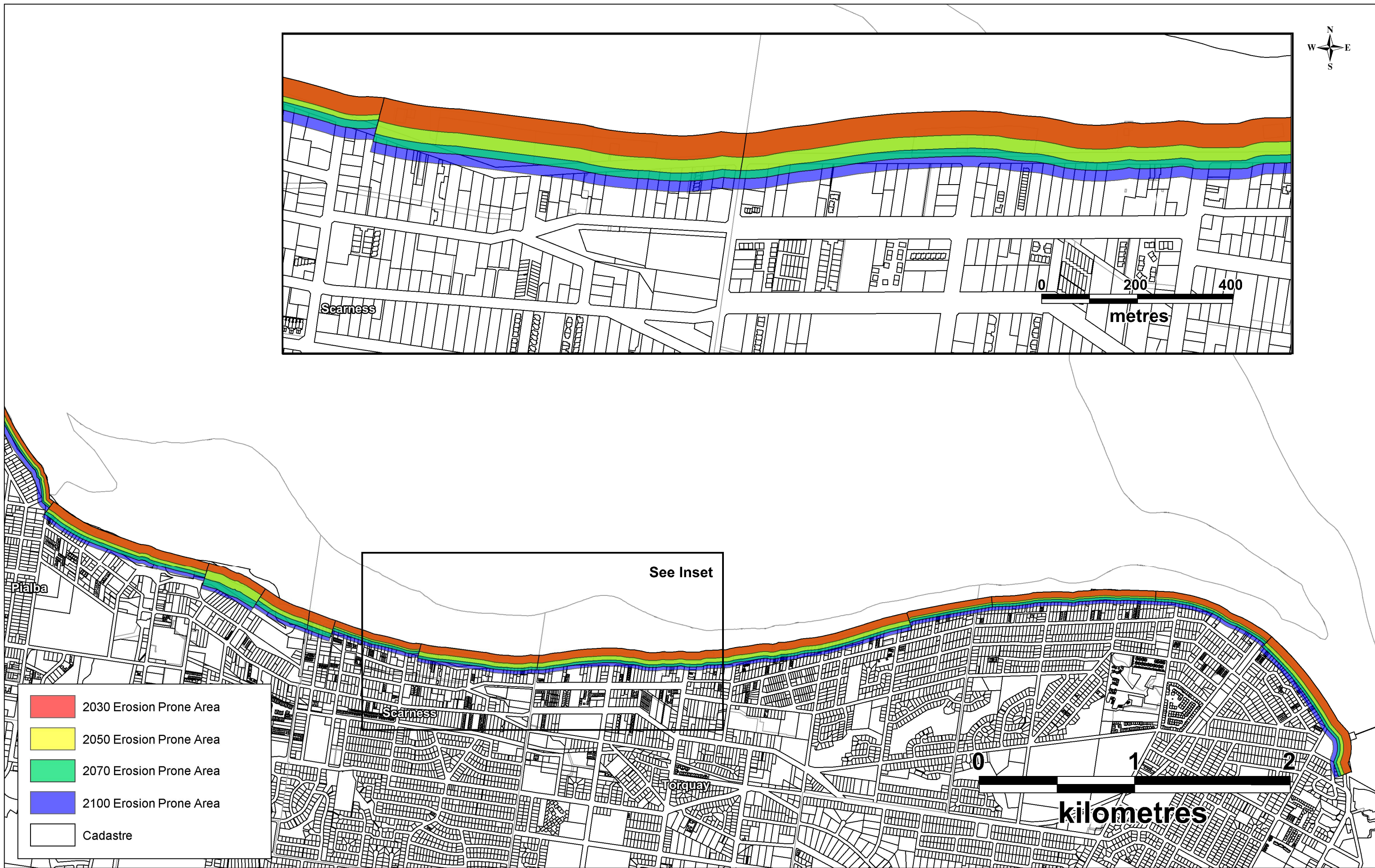
FIGURE E.3 EROSION PRONE AREAS - ZONE 3